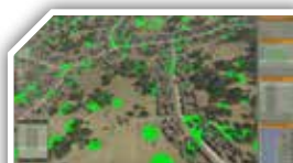
Edit large areas

By directly working in the simulation environment you can review your progress at any time without losing valuable time for exporting and importing into additional tools.